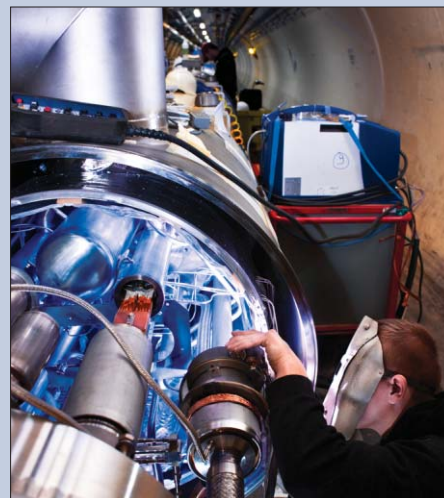
Interconnected A welder works on the junction between two of the Large Hadron Collider's superconducting-magnet systems.

But what lies beyond the Standard Model? Many high-energy theorists suspect there may be a large energy gap before something “interesting” appears again, which might require collision energies of 100–200 TeV or more (i.e. 50–100 TeV per beam). Unfortunately, a machine that could generate these energies and that is no bigger than a conventional collider