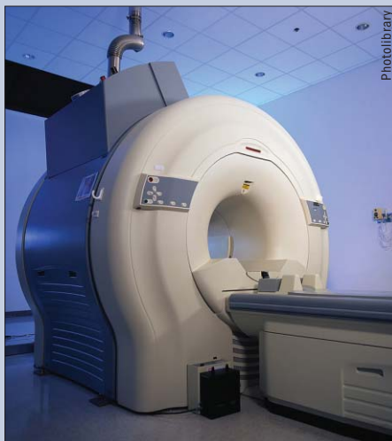
Take a picture A magnetic-resonance-imaging scanner uses small superconducting magnet coils to produce detailed images of any part of the body.

We should not forget that MRI-scale superconducting magnets have also had a big impact on condensed-matter physics and materials science. Most universities and industrial laboratories have at least one “physical properties measurement system” that can make a variety of transport, magnetic,